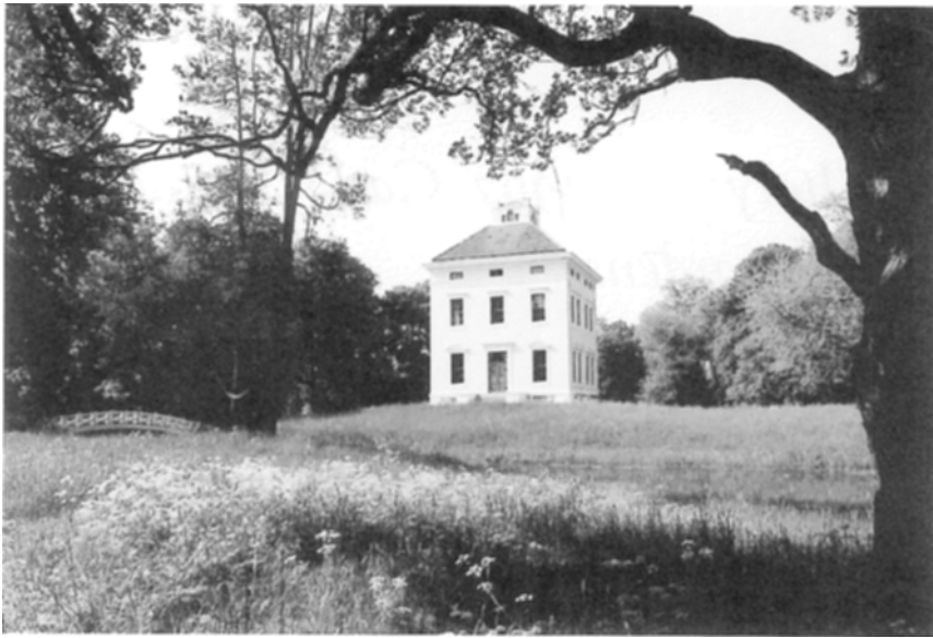
FIGURE 1. Schloss Luisium (1774–7), Halle, part of the Dessau-Wörlitzer Gartenreich. Photo: Marie-Luise Werwick, 1995.

he visited and the publications he assembled during and after these study trips, Prince Franz constructed a garden landscape that included a number of direct quotations from English models. Due largely to the conservation measures at Wörlitz that the Scarpa prize honors, it is still possible for visitors to the Gartenreich to encounter a quarter-scale reproduction of the bridge at Ironbridge, Coalbrookdale, a variation on Sir William Chamber's Chinese Pagoda Tower in Kew Gardens, and a copy of the 'Temple on the Terrace' at Stourhead, which stands today as one of the best preserved records of that now lost original building. As further testimony to the Prince's seemingly insatiable desire to reproduce the best of English landscape art in his small garden-state, at the time of its completion the garden landscape of Wörlitz also included, among its 24 buildings, a 'Pantheon' (1795–6). Situated on the northern tip of the larger of Wörlitz's two lakes and built during the third phase of the garden's original construction (1789–99), this Rotunda seems to be modeled not after the Pantheon in Rome, which the Prince knew from his travels to Italy, but rather, acting as a memory device, it is intended to